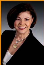
State Representative Charlene Fite